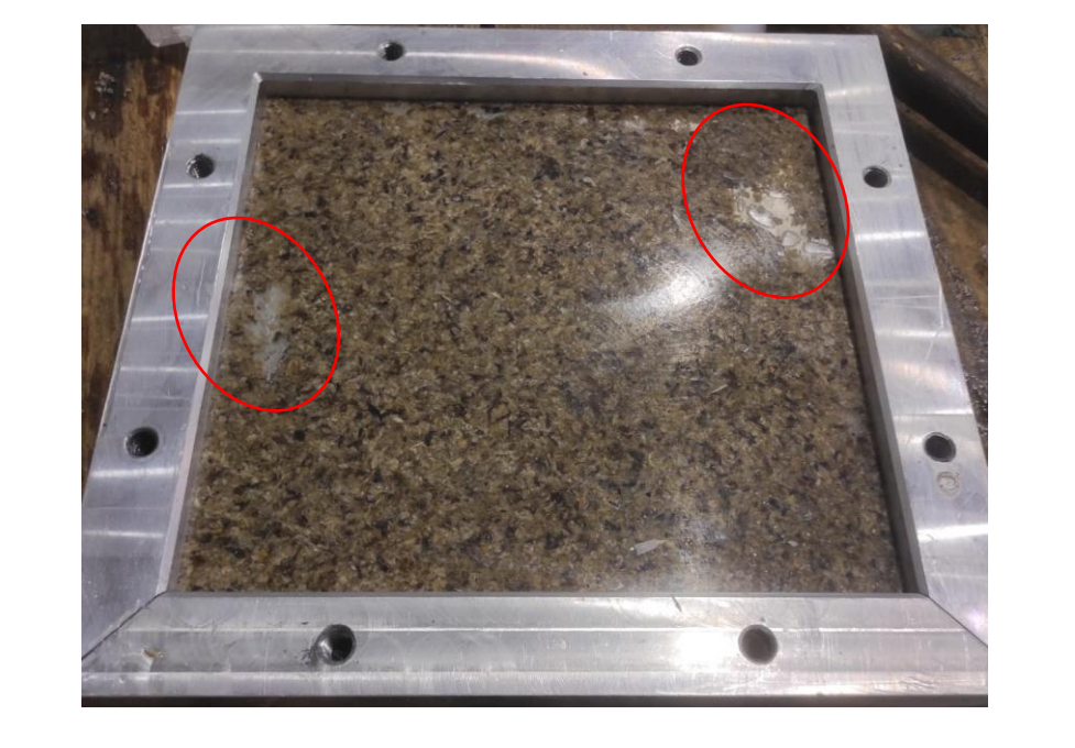
Figure 2 : a ) Air bubbles

Figure 2 shows some imperfections localizated in SBP samples.