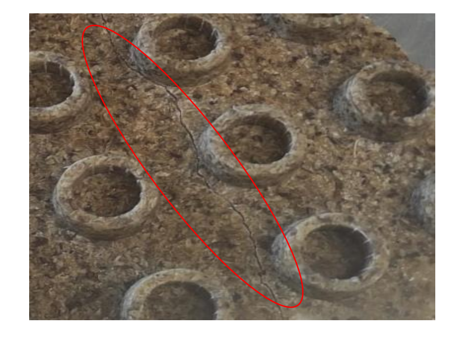
Figure 2: b) Cracks